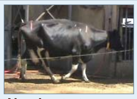
No short step