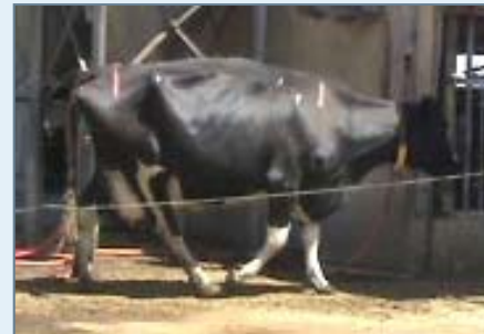
No short step